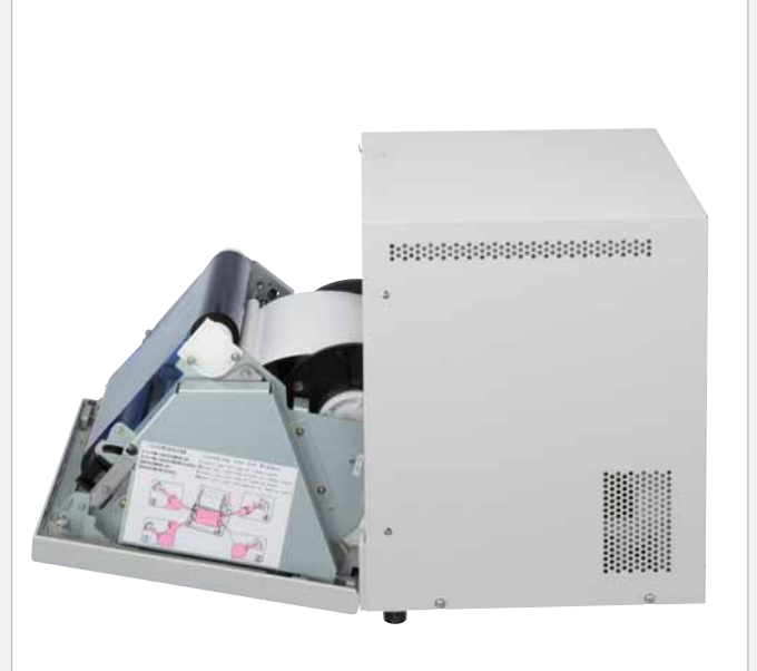
Useful Front Operation