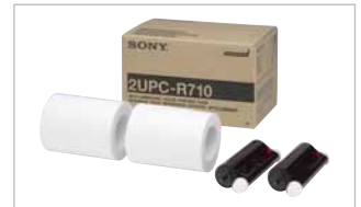
2UPC-R710 Self-Laminating Color Printing Pack Contents: 2 rolls of print paper, 2 rolls of ink ribbon